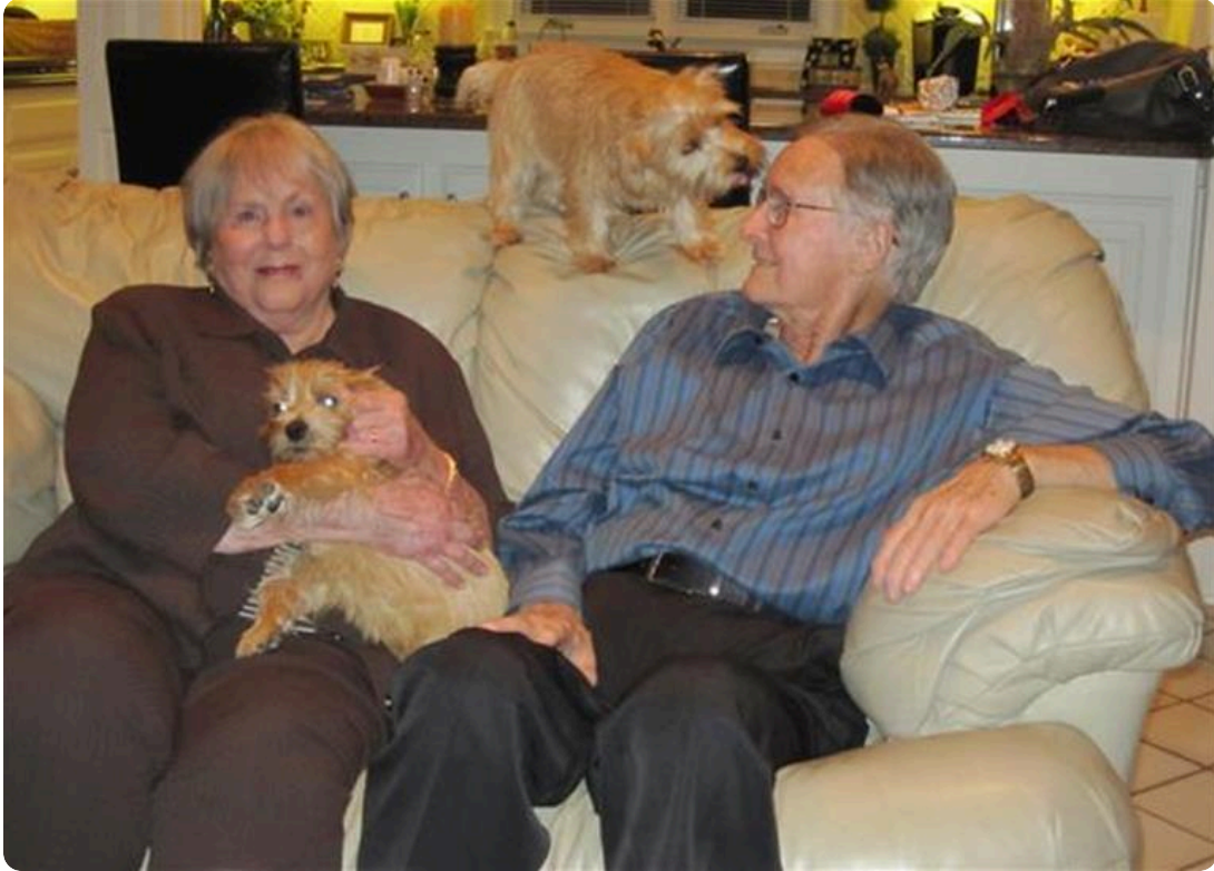
Nana and Dada with the puppies